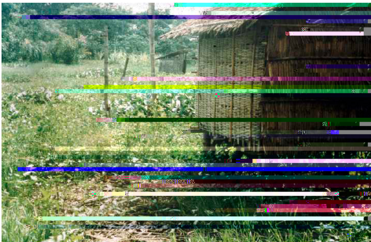
F 5. A raised latrine constructed on stilts

Low-cost, offset pour-flush latrines have been successfully used in marshy areas of rural Myanmar. The pour-flush latrines (as shown in the photograph in Figure 5) are built a metre above ground level on bamboo stilts with plastic pour-flush pans set into wooden floors. The pits, offset from the superstructure with the pipe sloping at 45 degrees, are covered only with a simple bamboo trellis and matting. This makes the pit cheap enough to be abandoned if it fills or becomes silted up. In this case a new pit can be dug and the pipe moved to connect to a new pit.